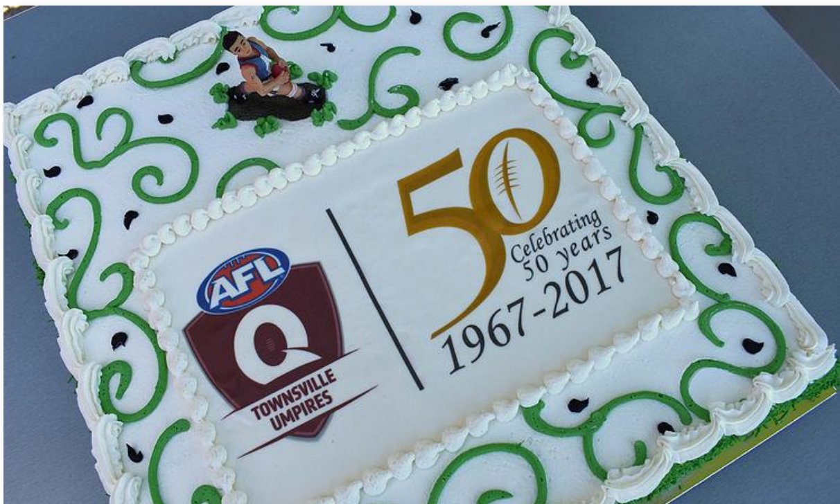
2017 Grand Final Day - cutting of the 50 th Birthday Cake

Over the 50 years the association has been active, there have been over 350 umpires come and go. Imagine if we could have got them all together, what a party it would have been and what stories would have been told, and how many Far Kups would come out of the woodwork!