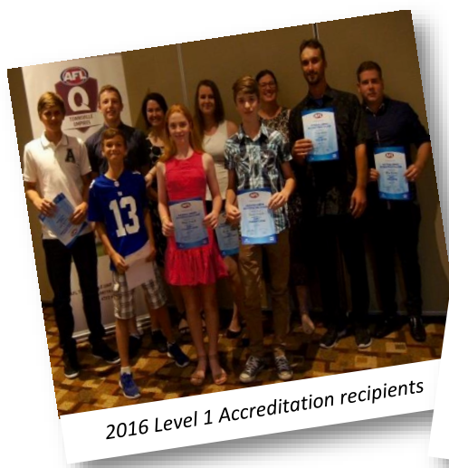
2016 Level 1 Accreditation recipients

late 80s as an informal afternoon gathering, to BBQs in people's back yards to having more formal functions (but not black tie!) that we have now, held at the RSL or a similar function venue.